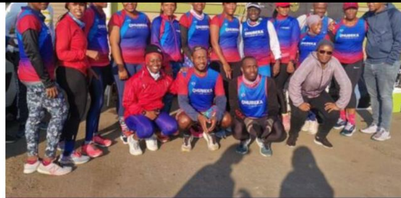
Members of the Qhubeka Running Club came in numbers to take part in the run on May 28.

Pad A Girl Organisation hosts a charity run in Wattville | Benoni City Times