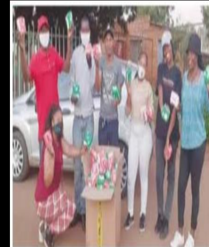
The ward 8 Covid-19 Disaster team with sanitary pads.